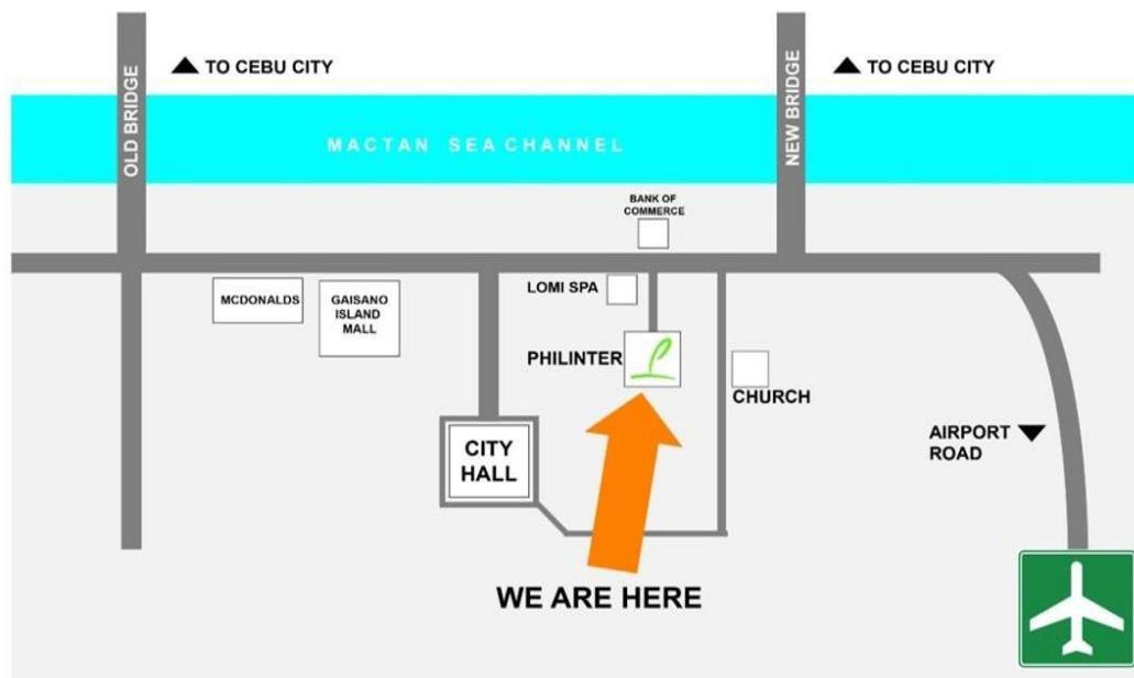
PHILINTER LOCATION MAP MACTAN, CEBU

To use Grab, search for "Philinter Education Center (JELAI)" and use it as your destination. 'Grab'