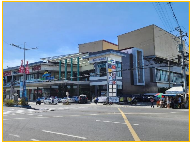
Marina Mall (left) and Island Central Mall (ICM)