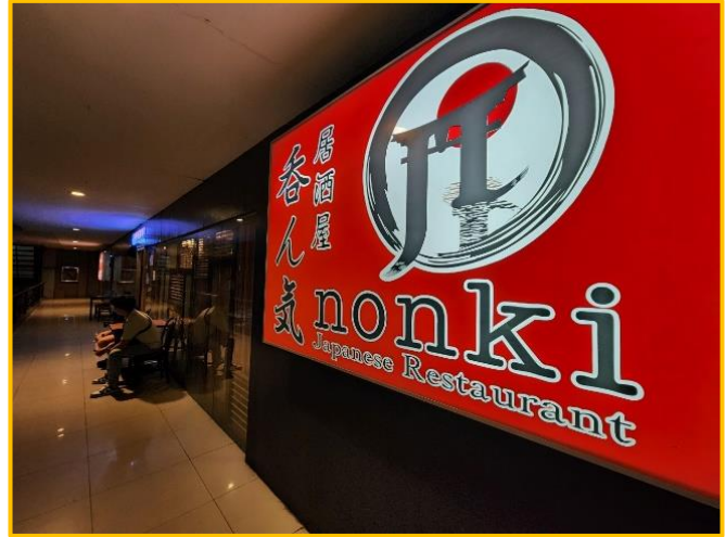
Starbucks and a Japanese restaurant are near Marina Mall. Japanese restaurant Nonki is 30 years old and is quite famous in Cebu.