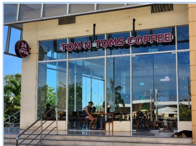
Gaisano Mall Left Entrance; Tom N Toms Coffee is on the first floor, to the right in the photo.